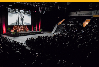
The Loyola Project kicks off its tour at Loyola University of Chicago in February 2022

THE FILMMAKERS ARE EXTENDING THESE OPPORTUNITIES THROUGH THE LIMITED 60TH ANNIVERSARY SCREENING SERIES FEATURING ONE-OF-A-KIND EXPERIENCES AT 60 BUSINESSES AND COMMUNITY ORGANIZATIONS. SIGN UP TO BE ONE OF THE SELECT 60 TO BRING THE FILM FOR YOUR ORGANIZATION, COMMUNITY, OR CORPORATE EVENT.