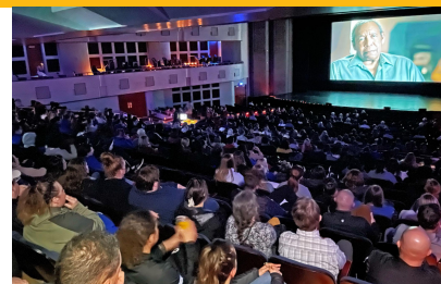
A sold out screening at the University of Kansas in March 2022