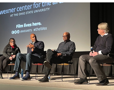
CBS's Clark Kellogg leads a conversation at The Ohio State University in March 2022